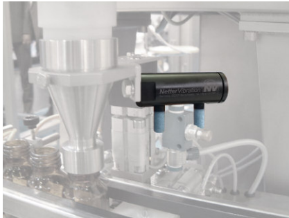
NTS 80 for filling small bottles