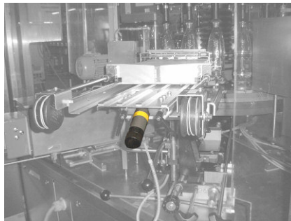
NTS 180 for labelling bottles