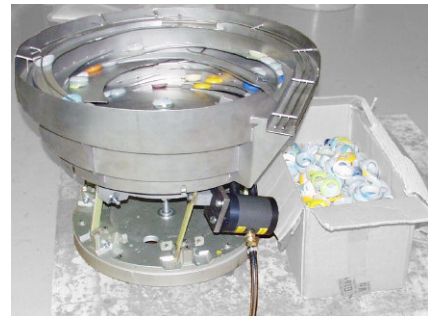
NTS 100/01 for spiral conveying of bulk materials