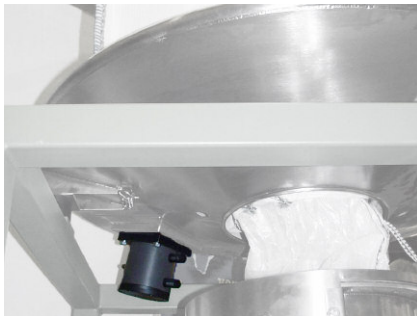
NTS 50/04 as delivery aid on big bag