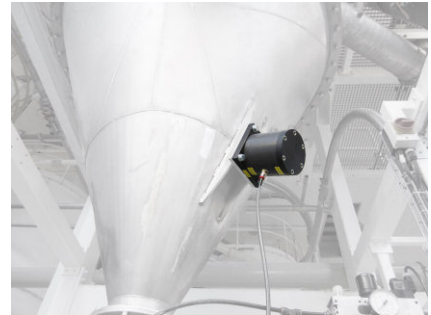
NTS 54/02 for improving material flow