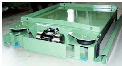
VTH/W 12/12 with 2 NEG 501510 for a weighing machine

NetterVibration offers the accessories required for the mounting, installation, control and monitoring of vibrators and vibrating tables.