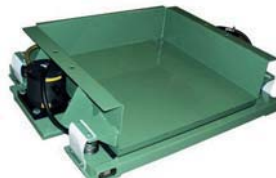
VTF 8/8 with 2 NTS 50/08 flat design