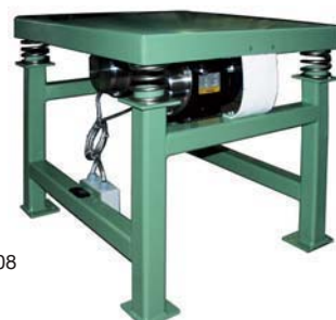
VT 7/8 with 2 NEG 50770 electric