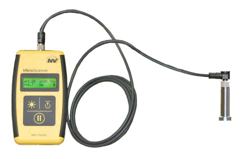
VibroScanner handheld unit for flexible and fast measurements of acceleration, frequency and amplitude